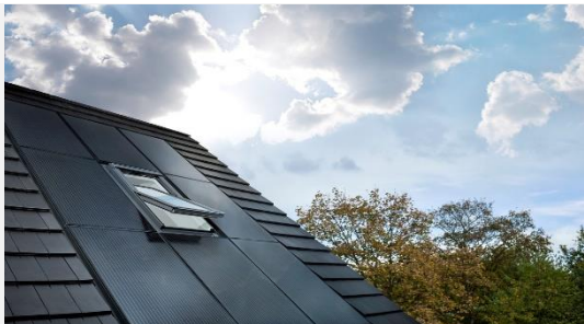
Integrates with Velux Skylights and Roof Windows